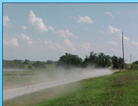
Fugitive Dust from untreated roads can produce tons